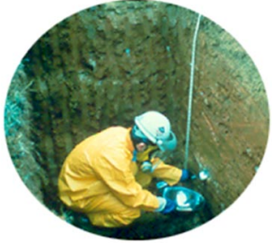
Site Assessment/Remediation and Feasibility Studies