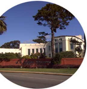
Base Realignment and Closure (BRAC)

Wideside Environmental and Site Specific Baseline Surveys (EBS/SSEBS)