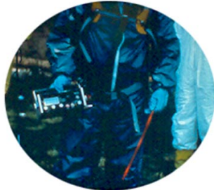
Environmental and Occupational Health